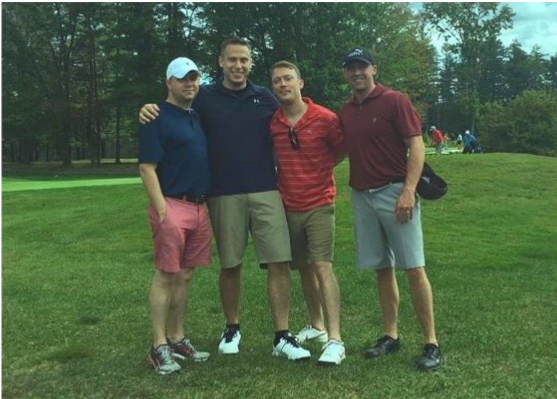
Bow Police participated in the 2017 Crimeline Golf Tournament.

Trick or Treating hours within the Town of Bow are 5:00 - 8:00 p.m. on Tuesday, October 31, 2017.