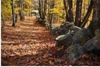
Hiking trail, fallen leaves, and stone wall in Bow.