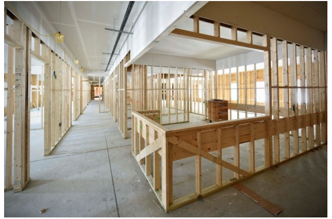
Interior construction at the Public Safety Building.

The building has been buttoned up for the winter and work continues on the interior of the building; wall, carpet, tile and cabinet colors have been chosen; and the project is on target for completion in mid-May.